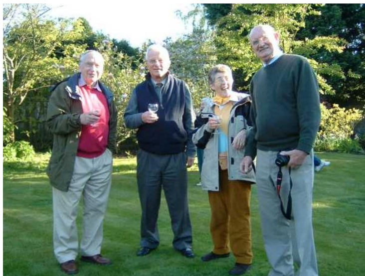
Members enjoy the May Open Gardens evening!

The first meeting of the new session is on