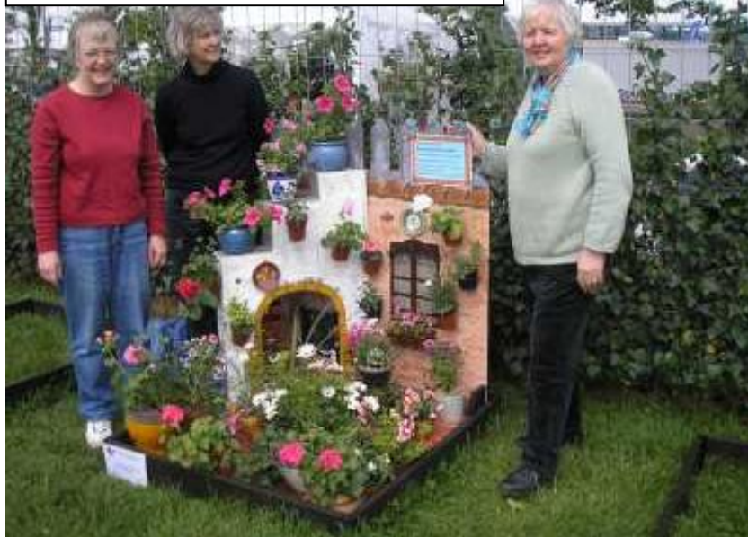
Some of the Gardening Scotland winning team