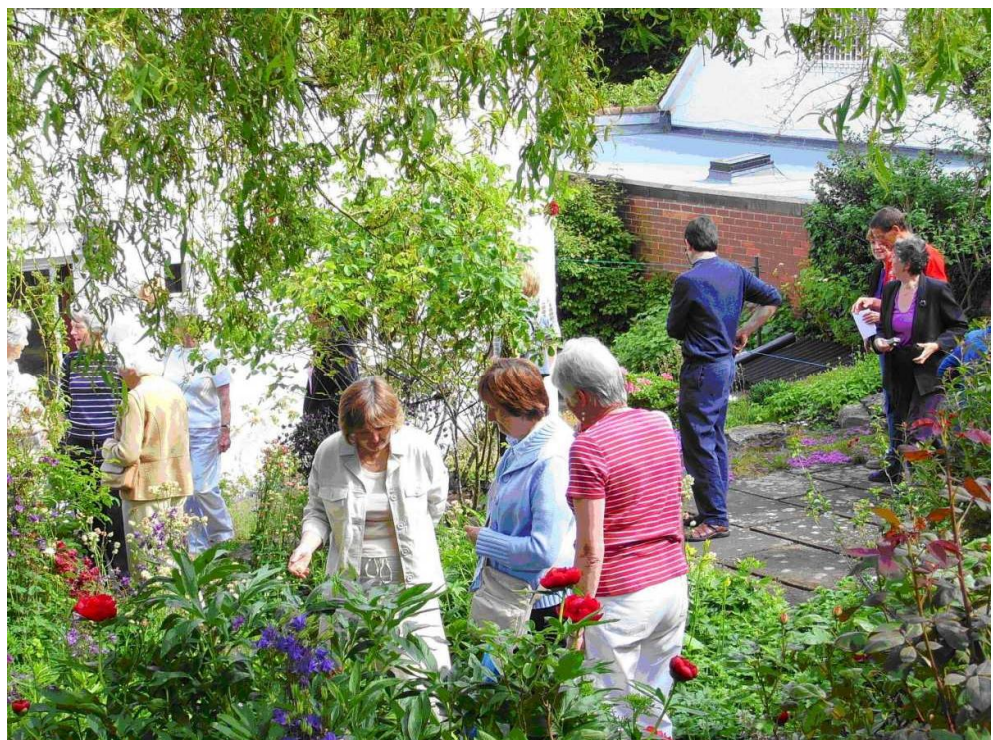
The sun shines on Garden Club members at our Open Gardens morning in June