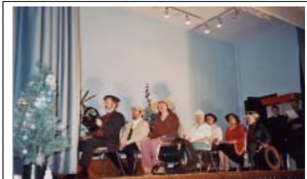
The Opening Scene of "Outing to the Lost Gardens of Hell-Again"