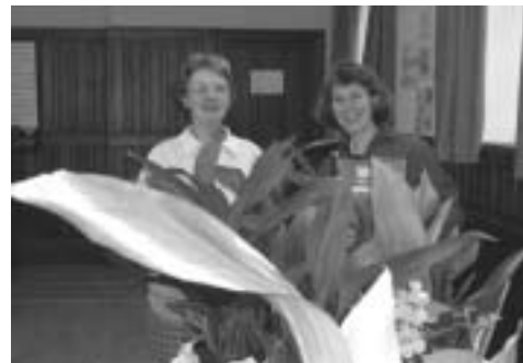
Well known faces lurk among the greenery at the Plant sale...